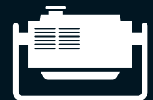
Portable Fuel Fired Generator